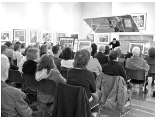
Below: Some of the crowd at the demonstration.